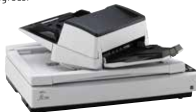
180 degrees movable ADF

Both scanner models feature a unique market proven design concept that adjusts to individual user preferences and requirements. The fi-7700's ADF unit slides to either side or rotates by 180 degrees.