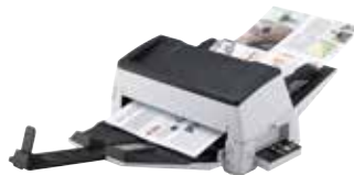
Straight paper path

The fi-7600 and fi-7700 automatically adjust to paper weights from 20-413 g/m 2 . The straight paper path reduces the load on a document and assures reliable scanning regardless of the condition and type of a document. By simply sliding a lever to non-separation mode, you can easily scan thick and long documents folded in half, multi-layered document sets and envelopes.