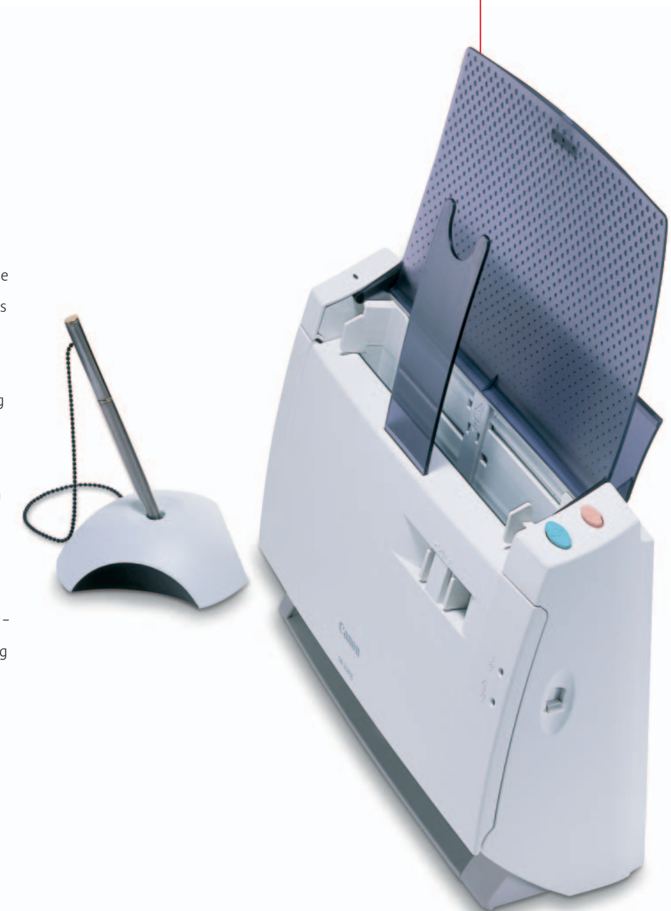
SO COMPACT IT FITS ON A COUNTER TOP

Also scanned images can be saved in PDF format - in high compression or standard mode. OmniPage™ OCR software ensures full text OCR is also included. Thus fully optimising all your image application requirements.