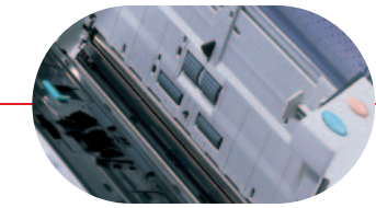
'Retard roller' mechanism achieves highly reliable separation and feeding of documents