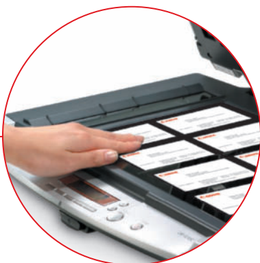
Scan up to 8 business cards in a single run