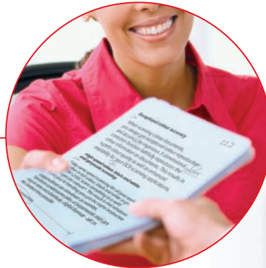
Scan light text and even pencil marks perfectly

When scanning colour documents, you always get exceptional colour reproduction and accuracy. An ingenious 3-dimensional colour correction function faithfully reproduces the colour information on documents. This results in superb colour quality as well as enhanced readability for all your OCR scanning applications.