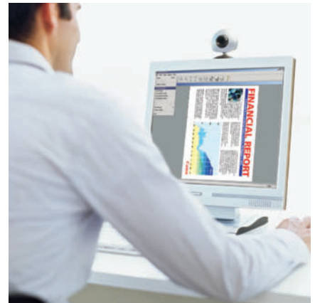
Enjoy CapturePerfect ease