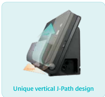
Unique vertical J-Path design

The vertical J-Path design allows documents to be fed and received vertically, so no extra desk space is required. Side-mounted cables and ports let you place both devices directly against a rear wall, or even on a shelf, for the ultimate in space-saving convenience.