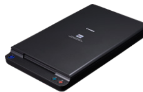
A4 Flatbed Scanner Unit 102

Scan bound books, journals and fragile media by adding the Flatbed Scanner Unit 102 for documents up to A4 or Flatbed Scanner Unit 201 for A3 scanning. Connected by USB, these flatbed scanners work seamlessly with the DR-C225 II (only) in a smooth dual-scanning operation that lets you apply the same image-enhancement features to any scan.