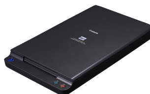
Flatbed Scanner Unit 102

Scan bound books, journals and fragile media by adding the Flatbed Scanner Unit 102 for documents up to A4 or Flatbed Scanner Unit 201 for A3 scanning. Connected by USB, these flatbed scanners work seamlessly with the DR-M260 in a smooth dual-scanning operation that lets you apply the same image enhancement features to any scan.