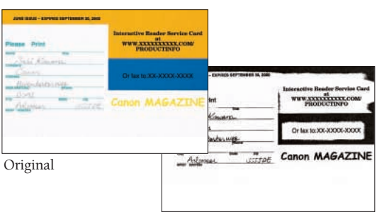
Scanning in Text Enhanced mode