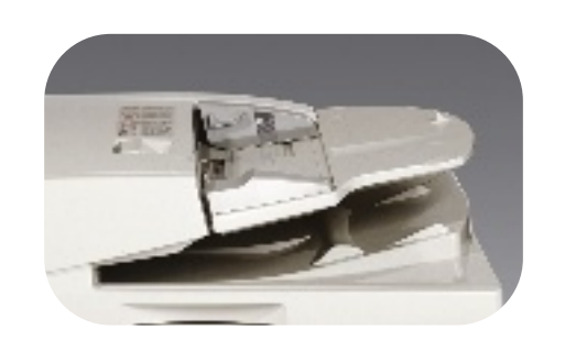
Extremely reliable feeder