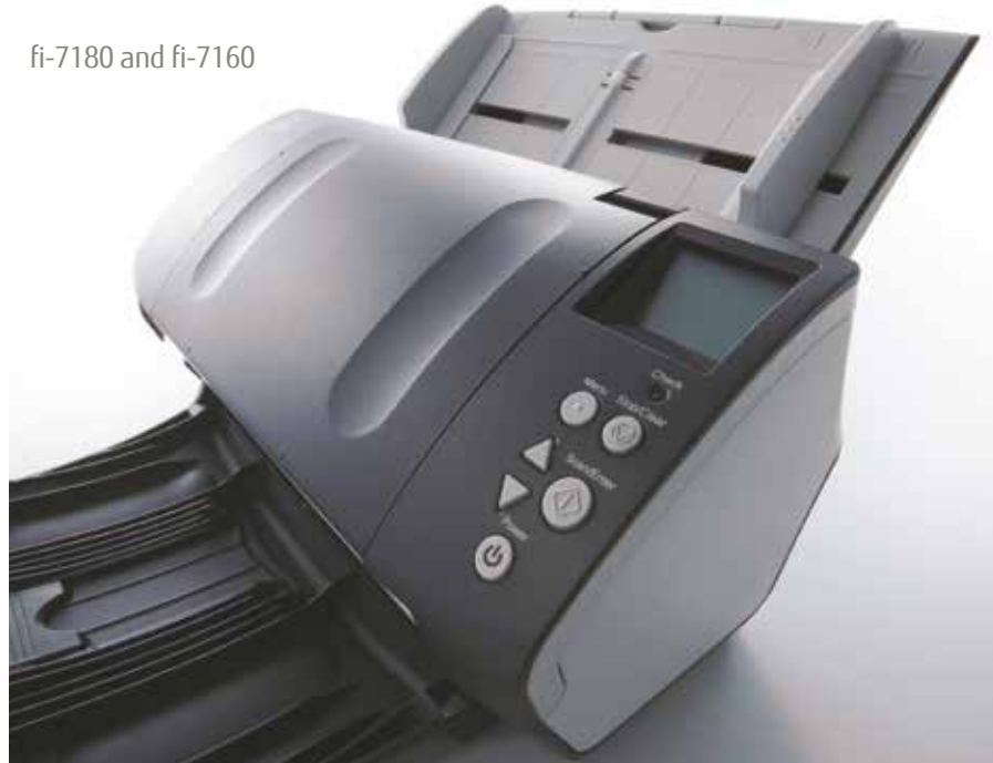
fi-7180 and fi-7160