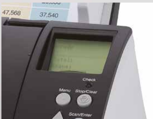
Integrated LCD operating panel

Scanner Central Admin software enable Fujitsu scanners to be managed and maintained from a single location to minimise scanner downtime anywhere on the global system.