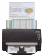
fi-7180 and fi-7160