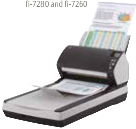
fi-7280 and fi-7260

fi-7160 / fi-7260 – A4 Portrait at 300 dpi 60 ppm / 120 ipm fi-7180 / fi-7280 – A4 Portrait at 300 dpi 80 ppm / 160 ipm Scan mixed batches through the 80 sheet ADF