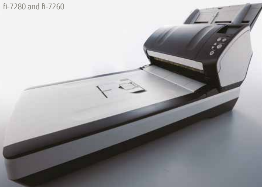
fi-7280 and fi-7260