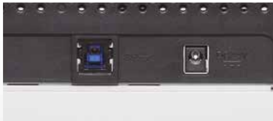
High speed performance through USB 3.0 interface

All four scanner models additionally make use of an ultrasonic sensor that accurately detects multifeed errors where two or more sheets are fed through the scanner at once plus the Intelligent Multifeed Function allows document scan parameters to be applied which enables the sensors to be set up to help identify and subsequently ignore attachments such as sticky notes or items with a photo attached that would otherwise cause disruptions to the scanning process.