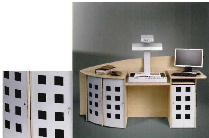
Mando furniture with Bookeye® N2

The furniture designed specially for Bookeye® combines elegance and modernity with ergonomic requirements on the scanning workstation. Sensibly integrated lockable compartments and storage areas enable the PC, keyboard and cables to be hidden securely from view. Mando furniture fits in harmoniously with existing fixtures and fittings. In addition to use in public facilities it has proven itself time and again in the self-service sector.