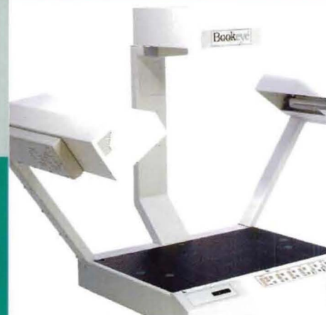
Bookeye® GS400 R2 Bookeye® Color R2