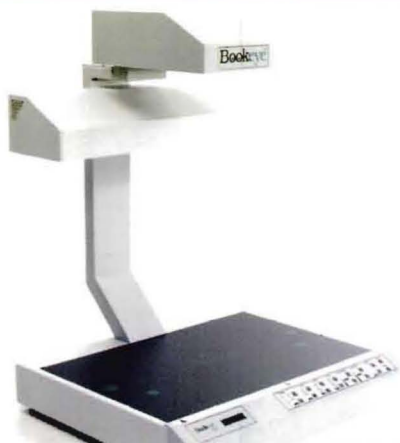
Bookeye® GS400 N2 Bookeye® Color N2