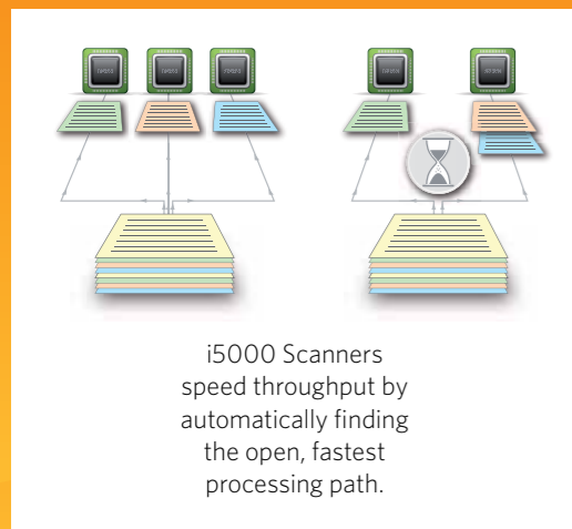
i5000 Scanners speed throughput by automatically finding the open, fastest processing path.