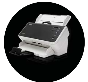
Alaris S2050/S2070 Scanners