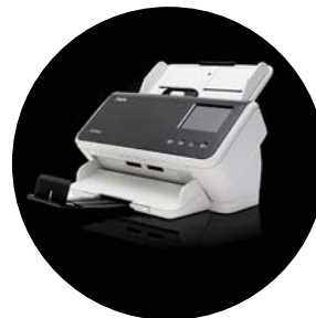
Alaris S2060w/S2080w Scanners