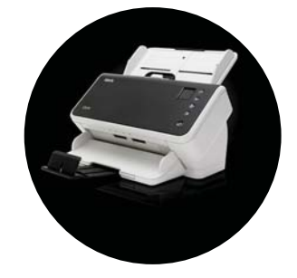
Alaris S2050/S2070 Scanners